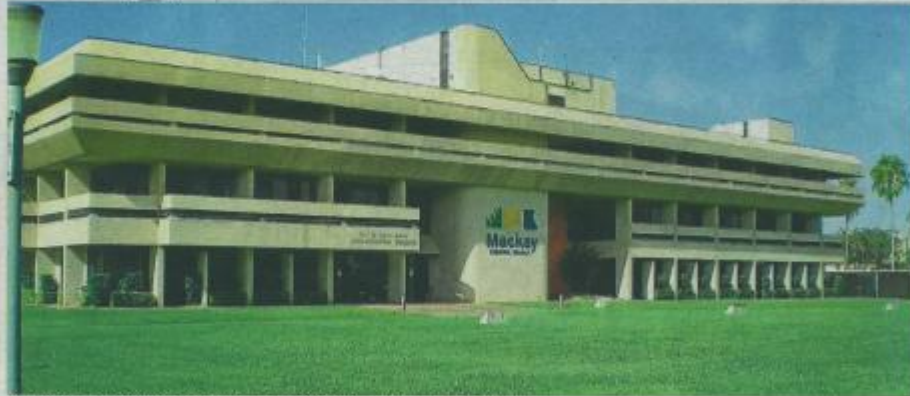
DRIVING DEVELOPMENT: Mackay Council liaises with banks to promote regional interests.

Carrillean said the upcoming council visit to southern based lenders, continued to raise the profile of the Mackay region, keeping the major banks in close touch with the needs of the "engine room of Queensland". "Continued access to finance for investment in this economically buoyant region is essential, especially