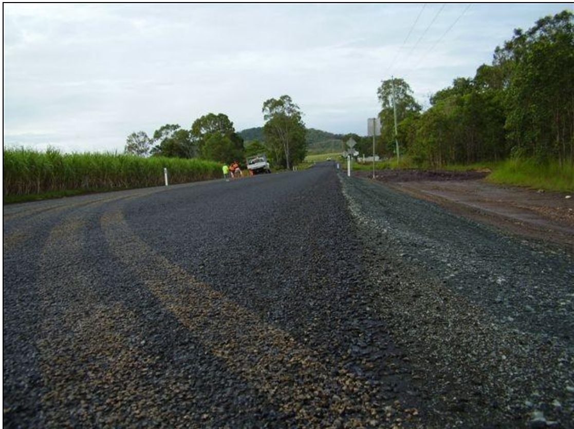
Grasstree Road - Sarina