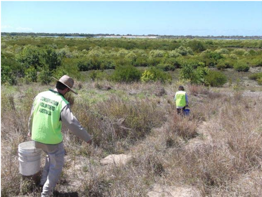
CVA volunteers watering recently planted seedlings at Sandfly Creek Environmental Reserve