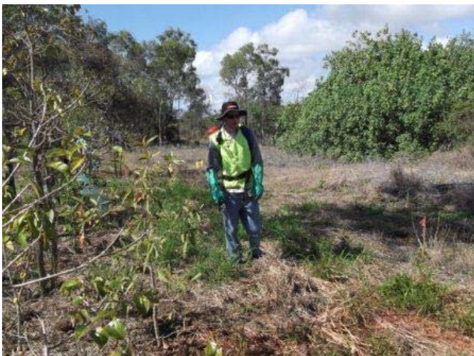
CVA volunteers undertaking weed control at Louisa Creek Reserve