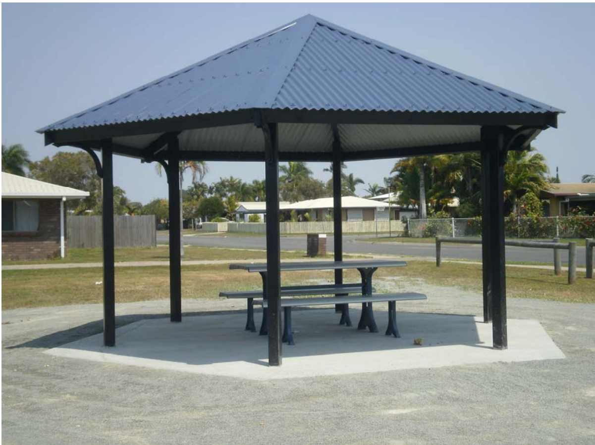
Napier St Park Picnic Shelter