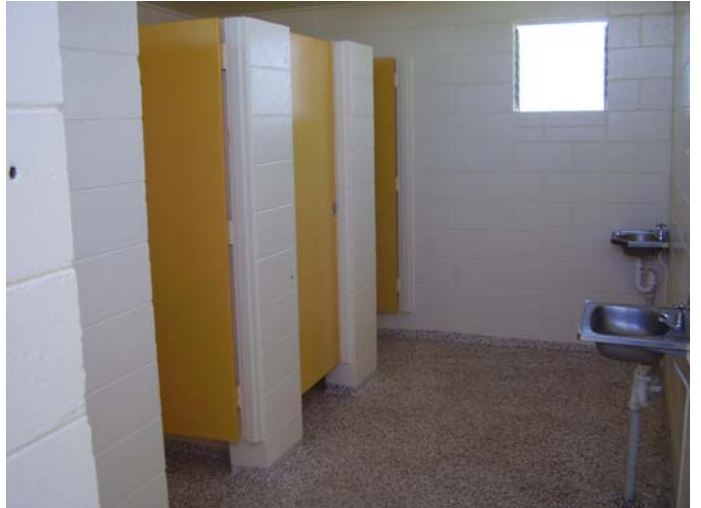
Gargett Amenities Refurbishment