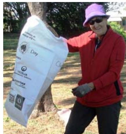
SLCMA volunteer at the Great Northern Clean up event at Grendon Park