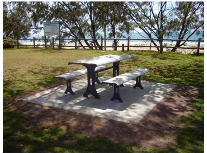
New Picnic Settings Sarina Beach