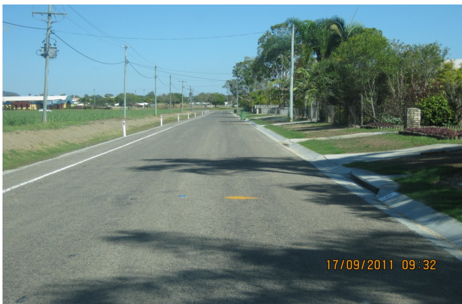
Perry Road, Walkerston