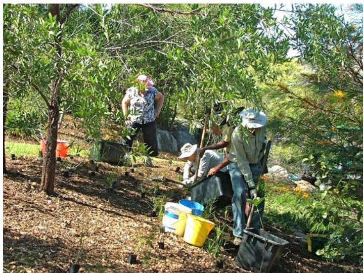
Mackay West Rotary Planting bee – Geology Garden – Sandstone bed.

Volunteers from Mackay West Rotary Club participated in a planting bee in the Coastal Lowlands and Geology Gardens on Saturday September 17. Nine participants were joined by the Gardens Friends and staff and 100 plants were added to the MRBG living collection. Trees and shrubs typical of Mackay’s coastal fringe and shrubs and grasses endemic to the sandstone ranges of Isaac Shire were planted in the botanic gardens ‘Summerlands’ sector.