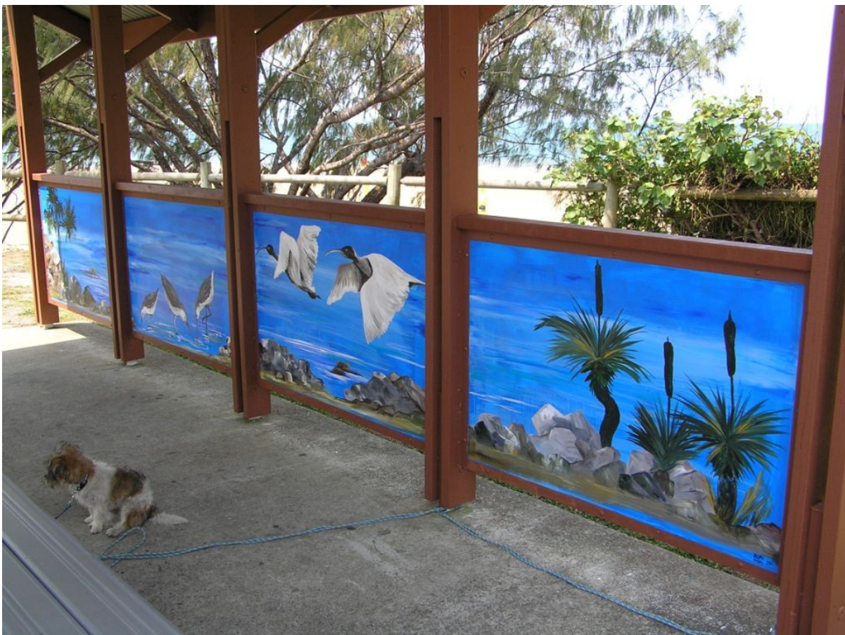
Murals completed by Progress Association and Local Artists On Recently Refurbished Picnic Shelter Sarina Beach