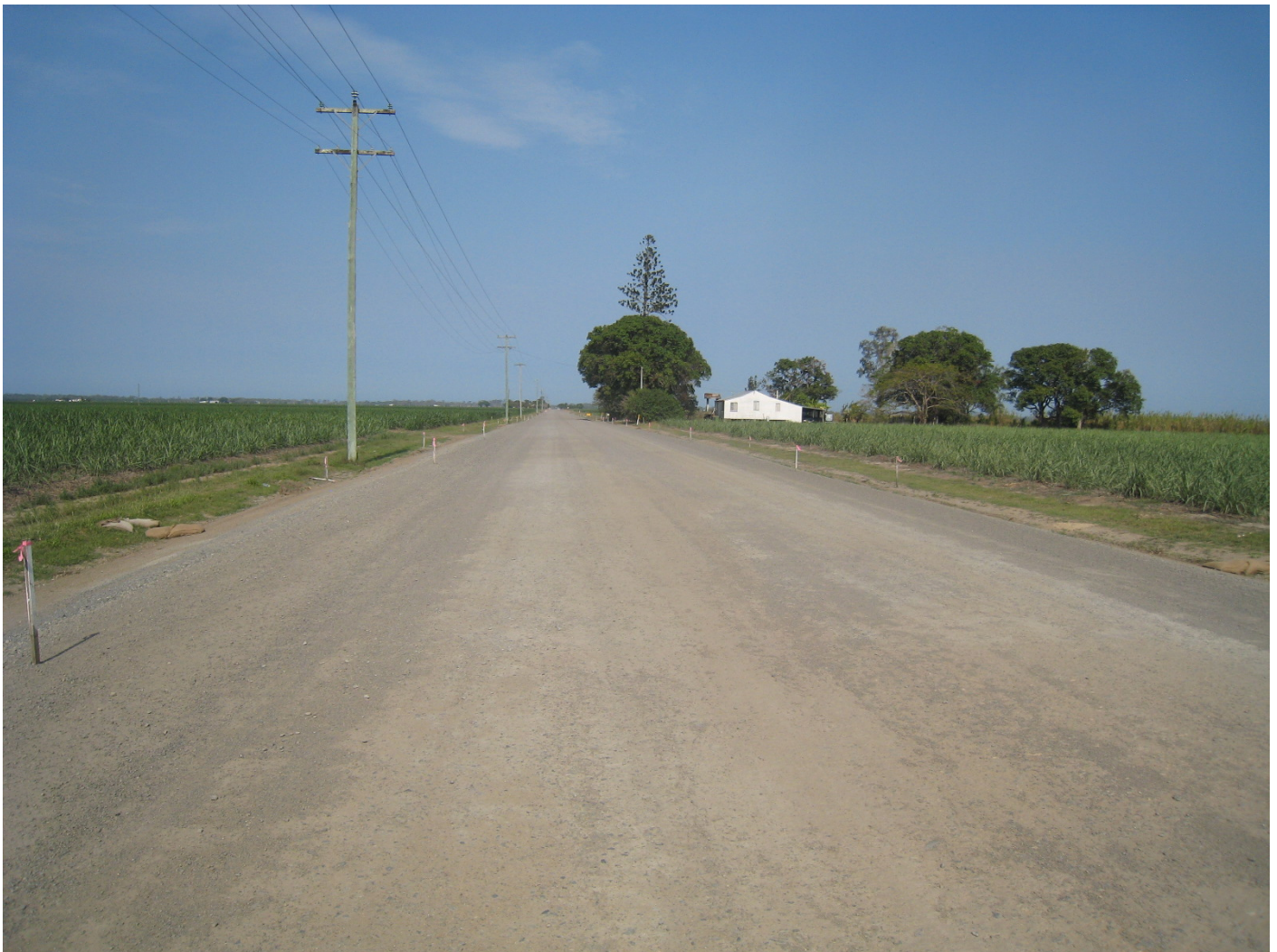
McEwens Beach Road