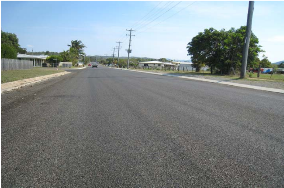
Petersen Street Sarina