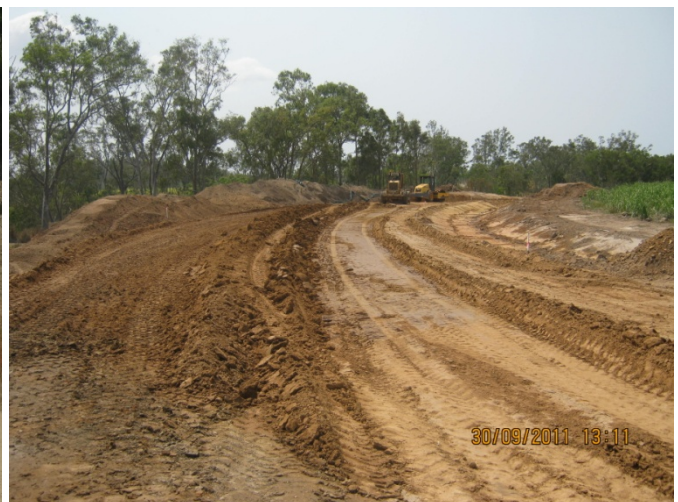
Caping Road Realignment & River Crossing Repairs, Bloomsbury