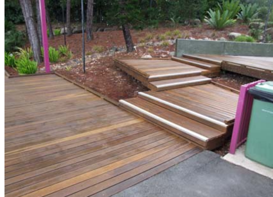
The Gymnosperm Deck re-oiled

Contracted projects were completed including the re-oiling of the timber decks around the main visitor precinct, repairs to bitumen pathways damaged during Cyclone Ului, extensive mulching of the PlayGarden and Tropical Palm and Pandanus Collection and the installation of a Fire Detection System at the Visitors Centre.