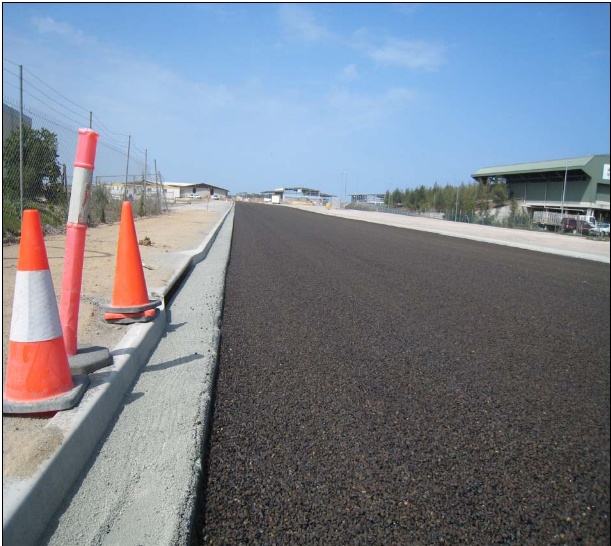
Crichtons Road, Paget