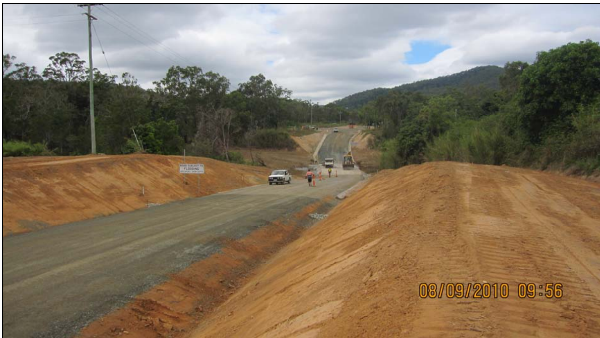
Rifle Range Road Reconstruction – Plane Creek Crossing