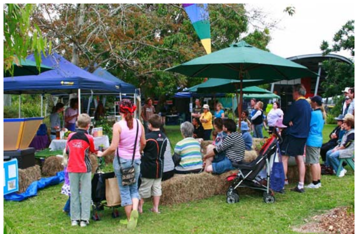
Community learn about sustainability from the Community Gardens display at LandCare Day in the Gardens

Guided school education sessions were conducted with 100 Prep children from West Mackay State School, 90 Prep children from Fitzgerald State School, 27 Prep children from Slade Point School and 29 year 5 children from Walkerston St John's school. The Garden's educational outreach program... 'Planted Elsewhere' took part in organised school visits to North Eton and Gargett schools and also participated in Education Queensland's "Yes Symposium" highlighting the sustainability Practices of schools. Children from Mackay and Moranbah utilised the site and staff at the Botanic Gardens for the Great Barrier Reef Marine Park Authority (G.B.R.M.P.A.) Future Leaders Eco Challenge, which