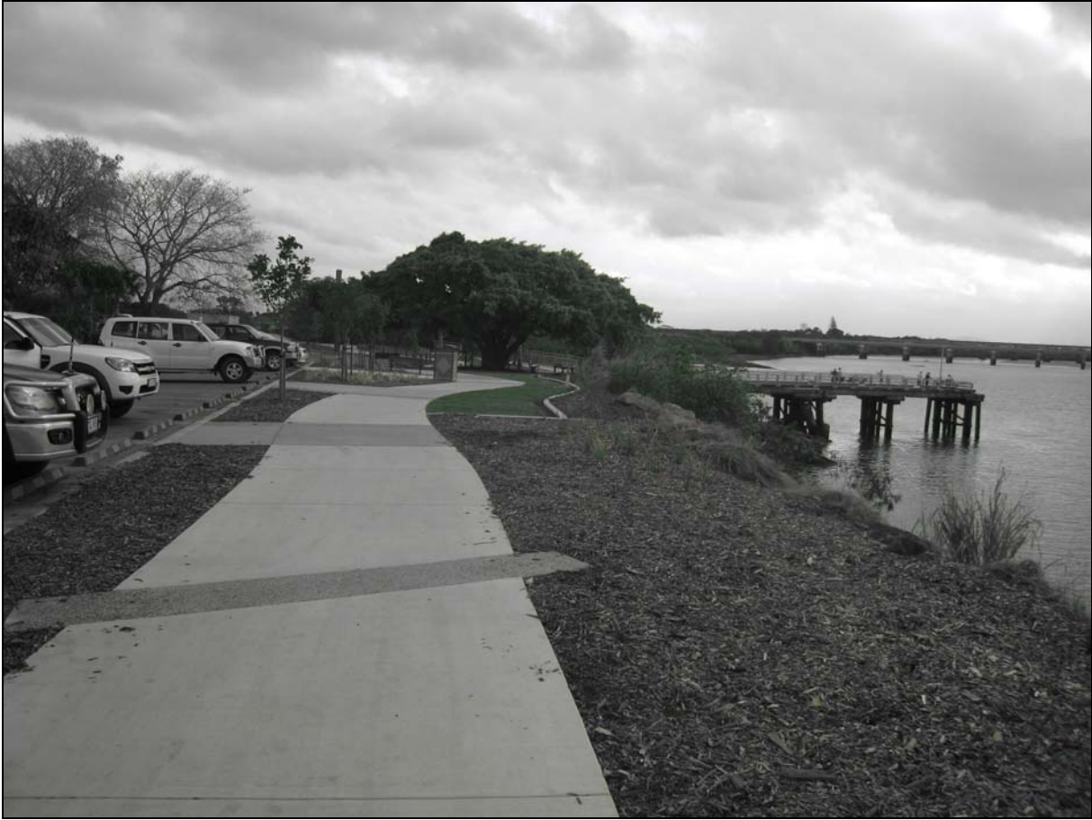
Blue Water Trail