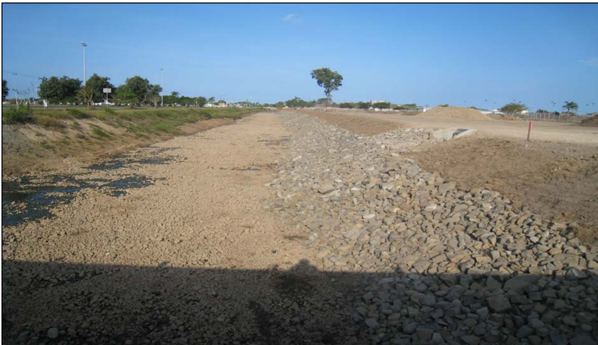
Bridge Road Cycleway and Drainage Improvement