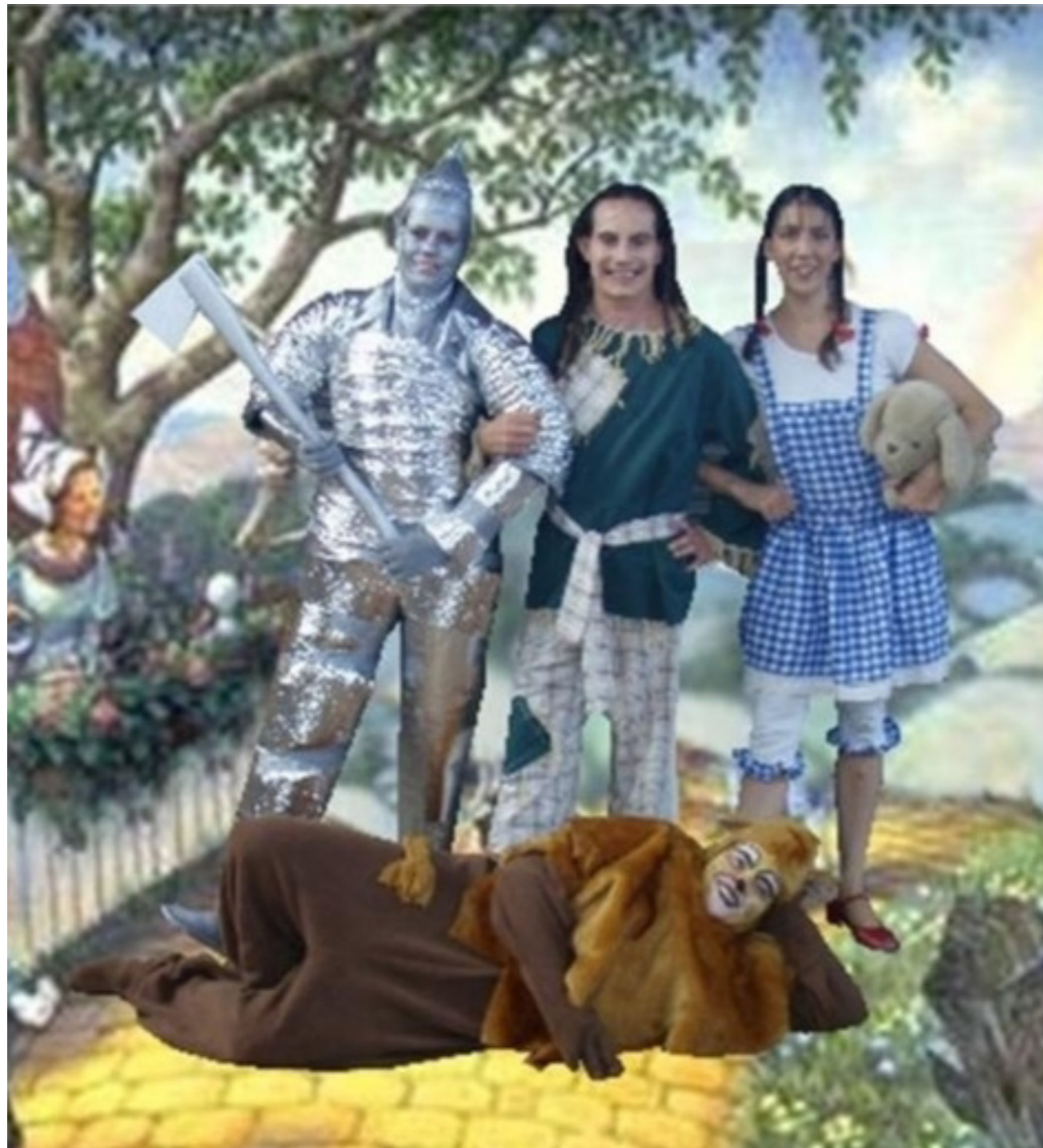
The Wicked Witch looks down at the Tinman, Lion, Scarecrow and Dorothy as they follow the Yellow Brick Road to Emerald City