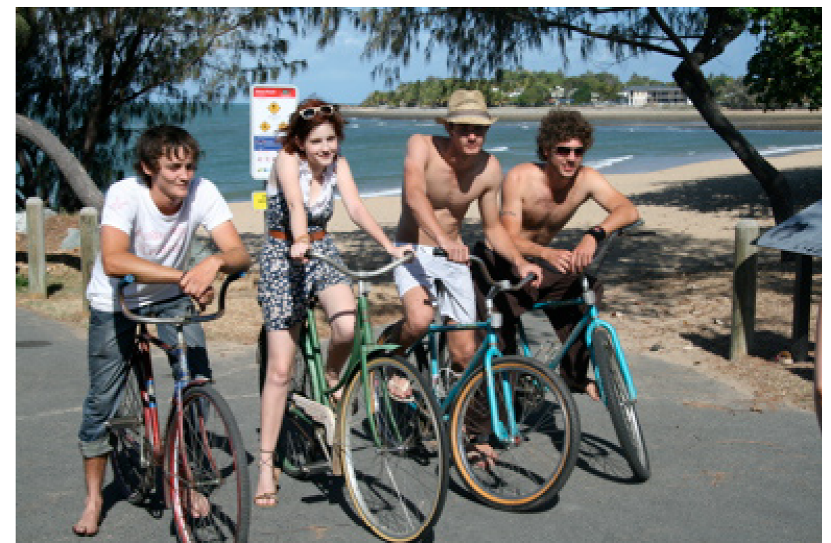
Local Band 'The Search' on set for the filming of their music video