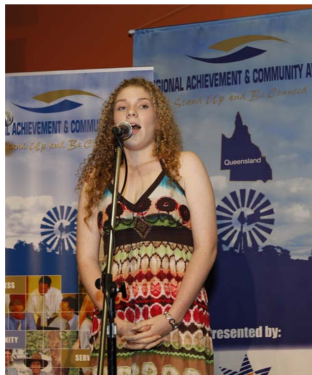
Queensland regional awards gala dinner November 2008