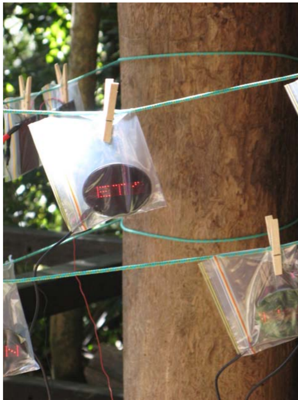
Ashley HOLMES Don't go near the water (detail) 2008. LED scrolling text badges, solar panel modules, clothes line, wooden clothes pegs, plastic bags, alligator clips