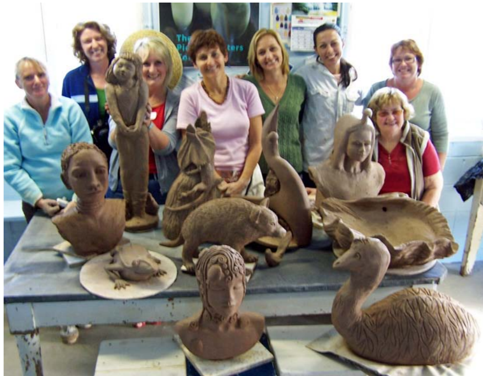
Participants & sculptures from workshop No.1