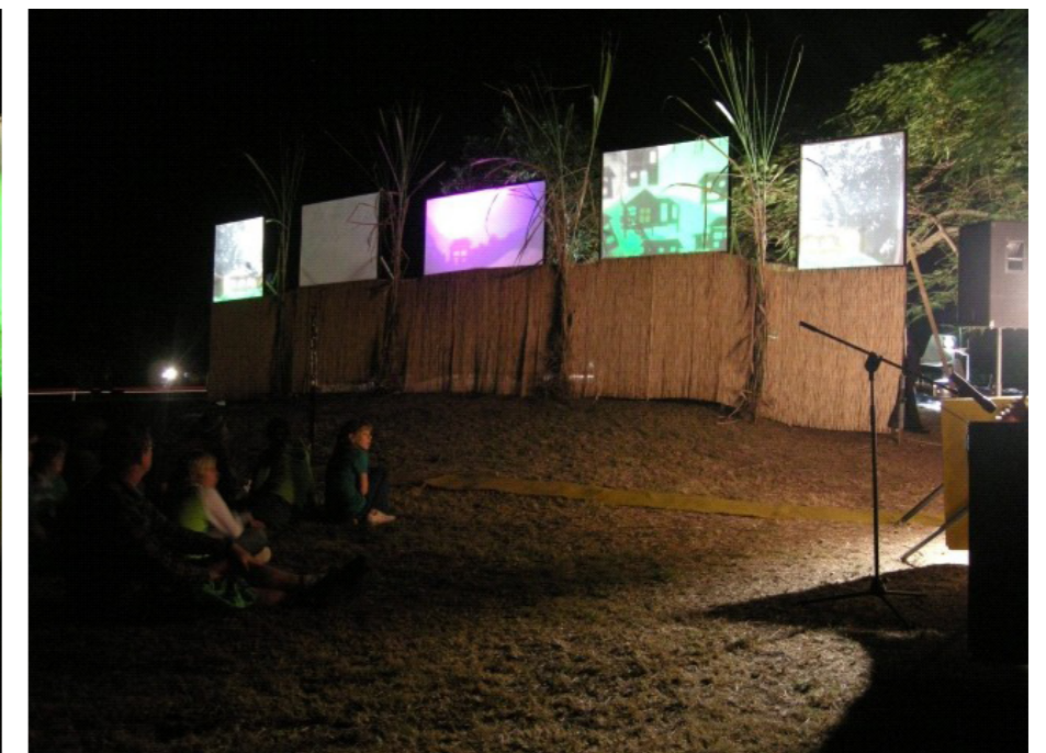
The Shadow Puppetry performance at the Launch of the River Rock to Mountain Top Community Festival