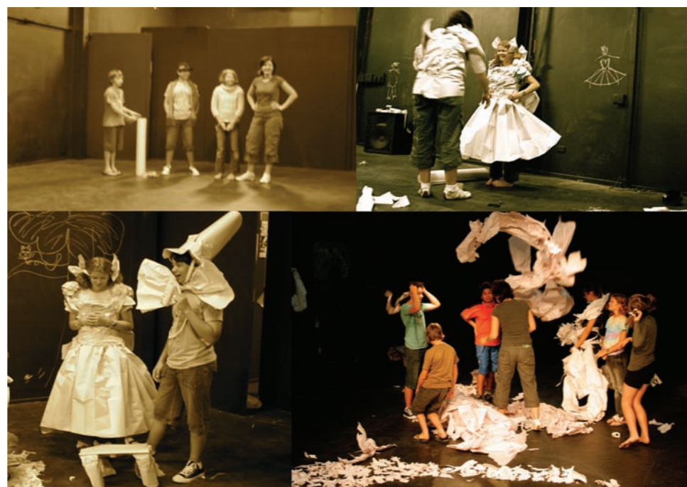
Scrawl design masterclass