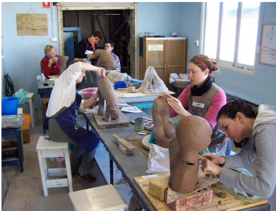
Budding sculptors at work