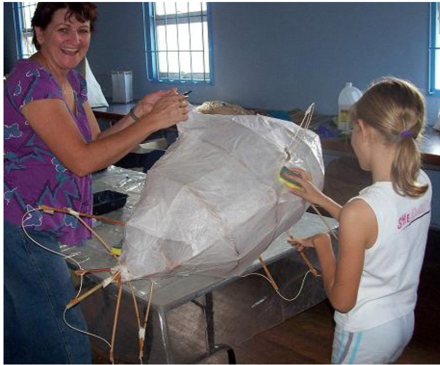
Participants work on their lantern at one of the Community Workshops held in the Pioneer Valley