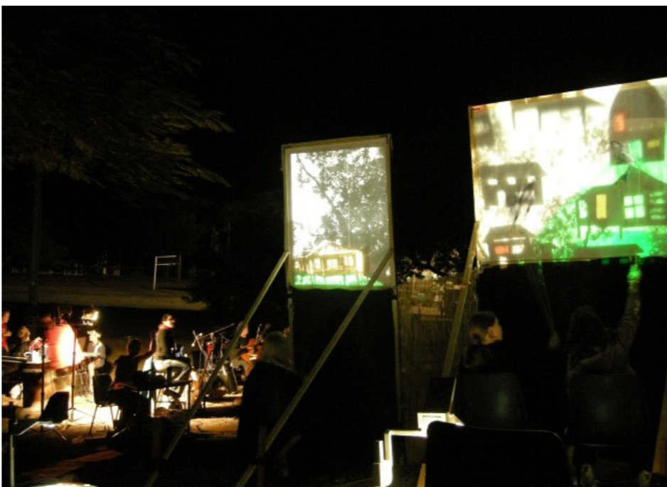
The team rehearses their performance ready for the Launch event