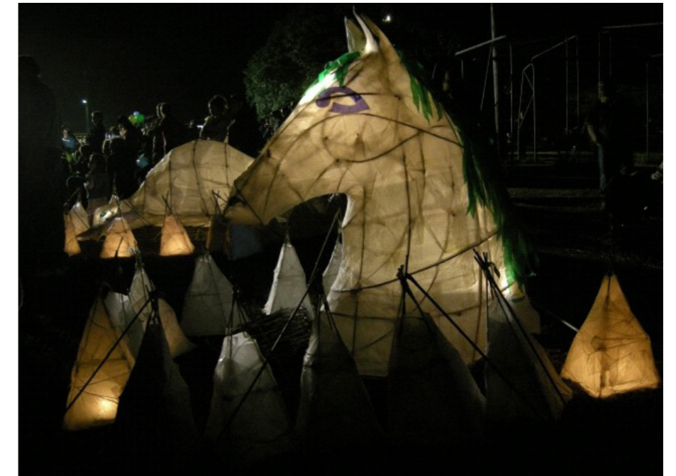
Lanterns continue to glow after the Parade has reached the site of the Festival Launch in Mirani