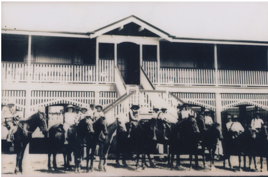
School children travelled to Farleigh Catholic School on horseback and rested their animals in a nearby paddock during the day. circa 1930's