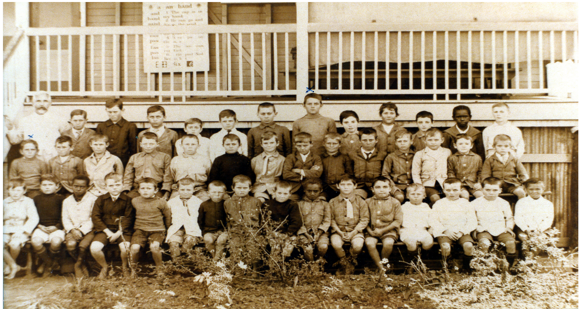
Forty-two students of Farleigh State School all ready for a day of learning. circa 1916