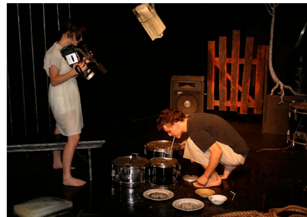
Smashed music masterclass and caught film masterclass