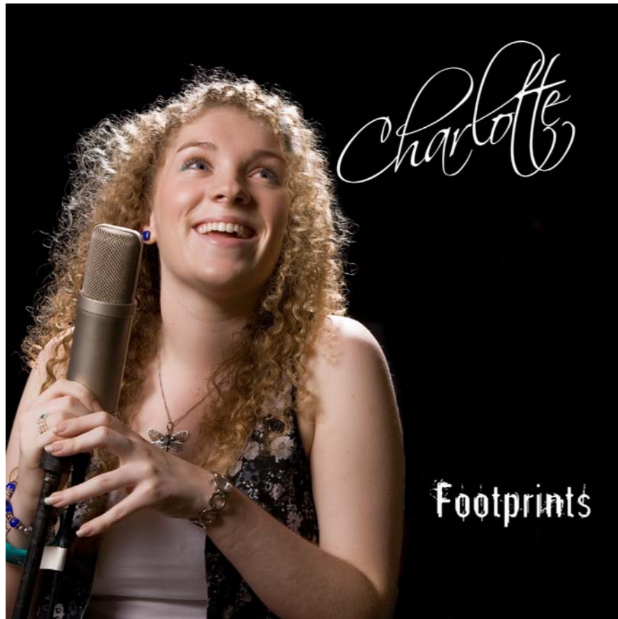
The Album Cover 2008