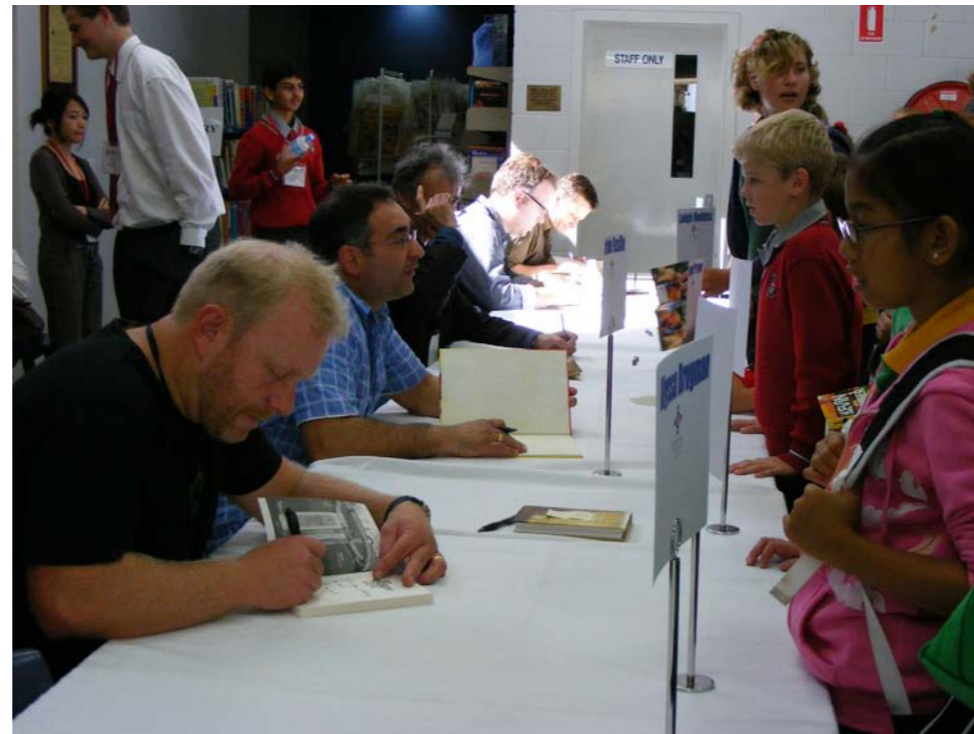
Author book signing table – a busy place!