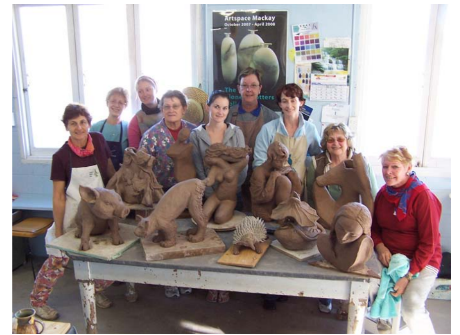
Participants & sculptures from workshop No.2