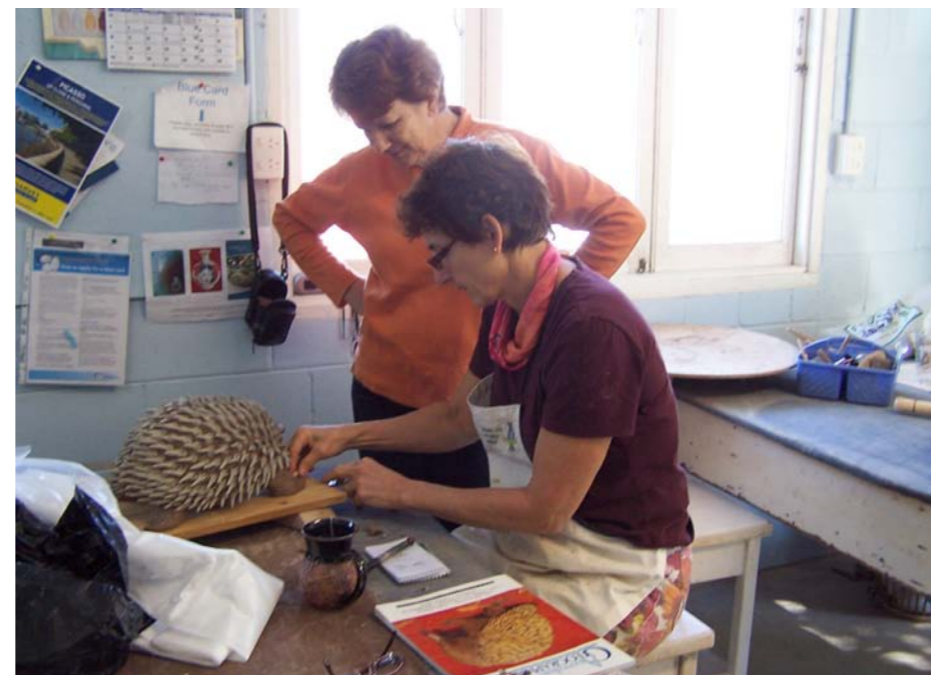
Tutor with participant from Mirani