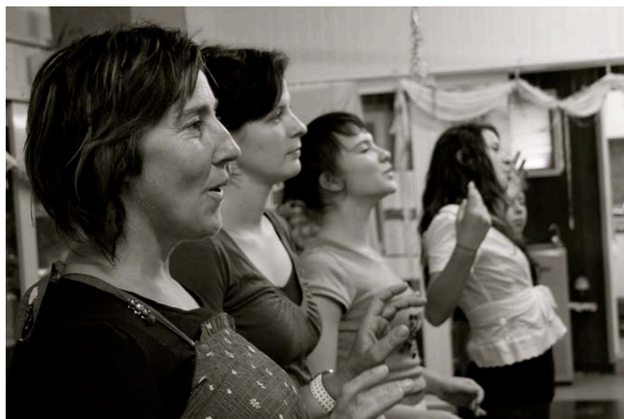
0.7 degrees theatre masterclass