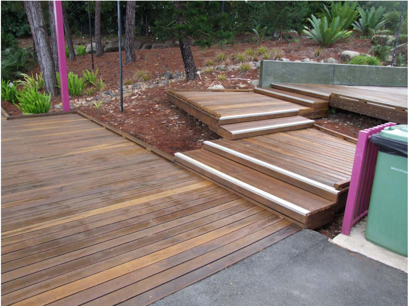
Mackay Regional Botanic Gardens Gymnosperm Deck Oiling Project

Masterplan Review and Planning – Public consultation period completed and report to Council for adoption on 7 th July meeting.