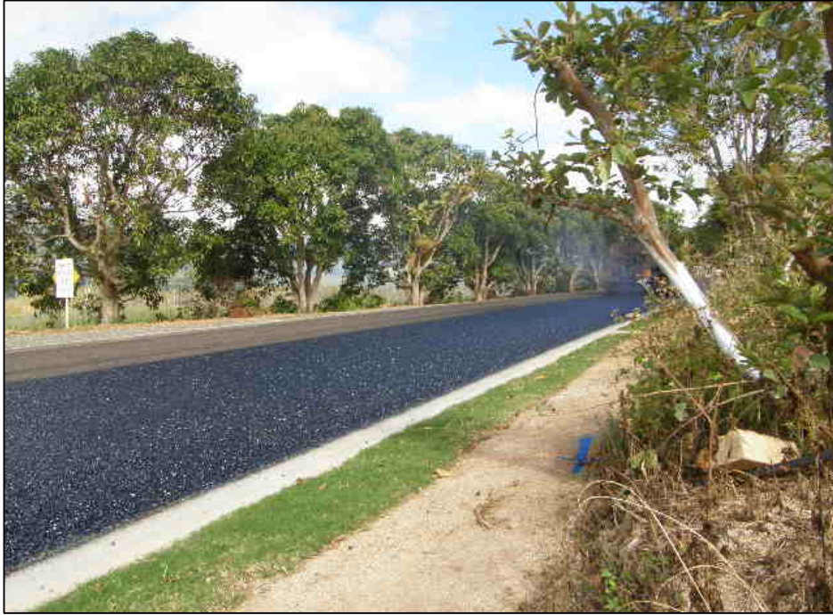
Gorge Road - final sealing works

Works have been substantially completed on the following projects: