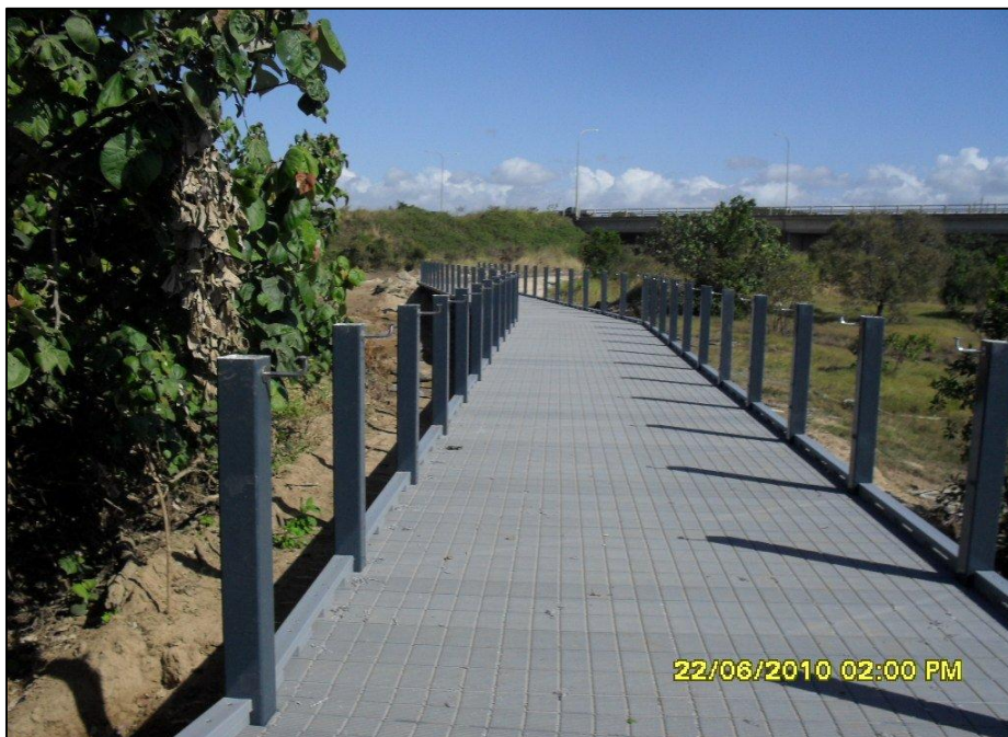
Bluewater Trail Environmental Park