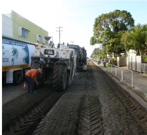
Flood Damage Package 7 – Bridge Road

Package 7 – Contract awarded to BMD Constructions - $1 462 714.47 – works 90% complete