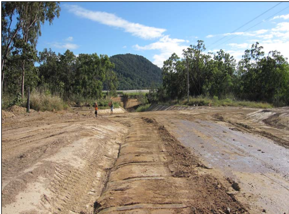
Rifle Range Road Reconstruction – subgrade works

The following projects have been awarded but not yet started: