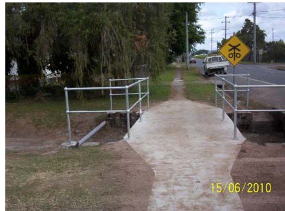
Daly Street, Marian – replace footbridge with box culverts and slab.

Line marking was carried out on the following roads – Warner, Pinder, Ferguson, Brooks, Don, Mogford, Paul Hopkins, Barton, Galletly, Stoneham, Gregory, Wellington, Mackenzie, Ness, Holland, Tait, Beaton, Sneyd, Nelson, Hunter, Schaefer, Hume Streets, Ness Street, Depot, Carparks at River/Gregory and Gregory Streets, Cemetery Road, Conningsby State School, Mangrove Road, Victoria, Milton, Field, Webberley, Simpson, Wilson, Harvey, Dunn, Donaldson, Longair, Perry, Joanne, Napier, Clements & Absolon Streets and Robb Place.