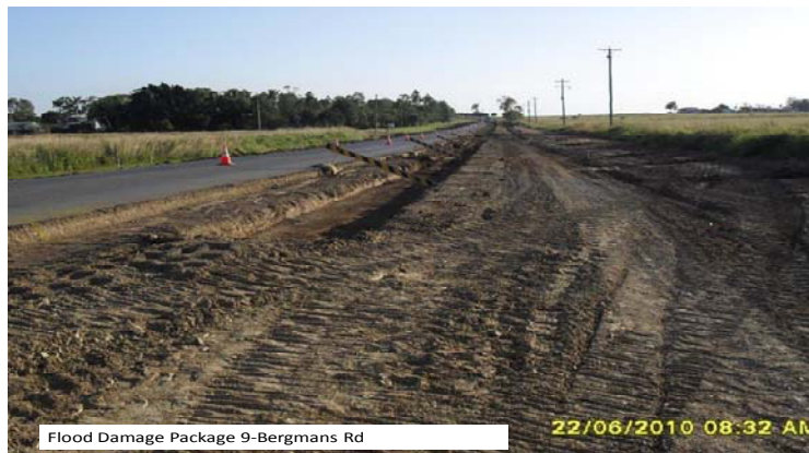
Flood Damage Package 9-Bergmans Rd

Package 9 – Contract awarded to Vassallo Constructions - $2 516 682.00 – works have commenced and due for completion August 2010