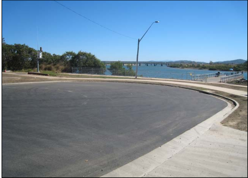
Bridge Road - Blue Water Trail

Works have been substantially completed on the following projects: