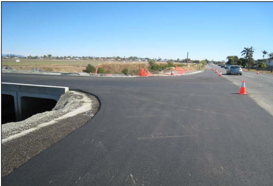
Leisure Court Intersection