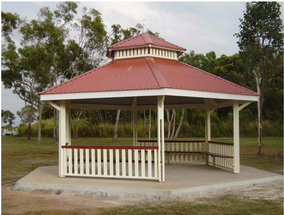
New Rotunda situated in Mt Bassett Cemetery