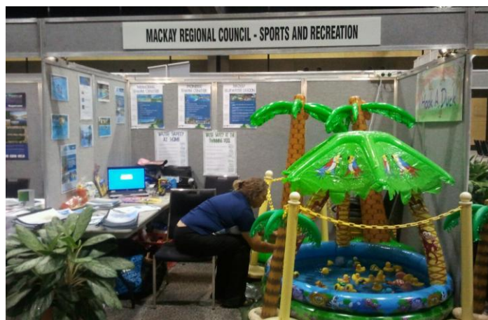
Tourism and Hospitality Industry Expo