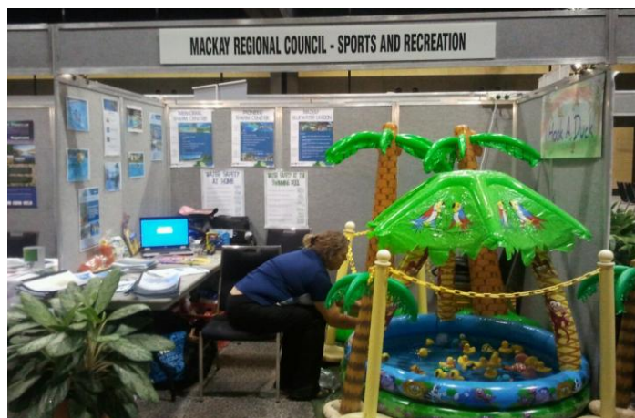
Tourism and Hospitality Industry Expo