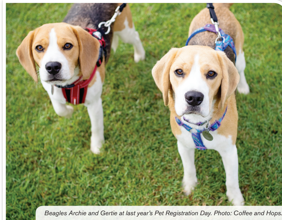
Beagles Archie and Gertie at last year's Pet Registration Day.

will again be broadcasting live from the event.