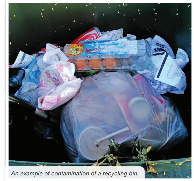
An example of contamination of a recycling bin.

Three inspections have been conducted annually for the last two financial years, with 6754 bins inspected last financial year, up from 5553 bins in 2014-15.