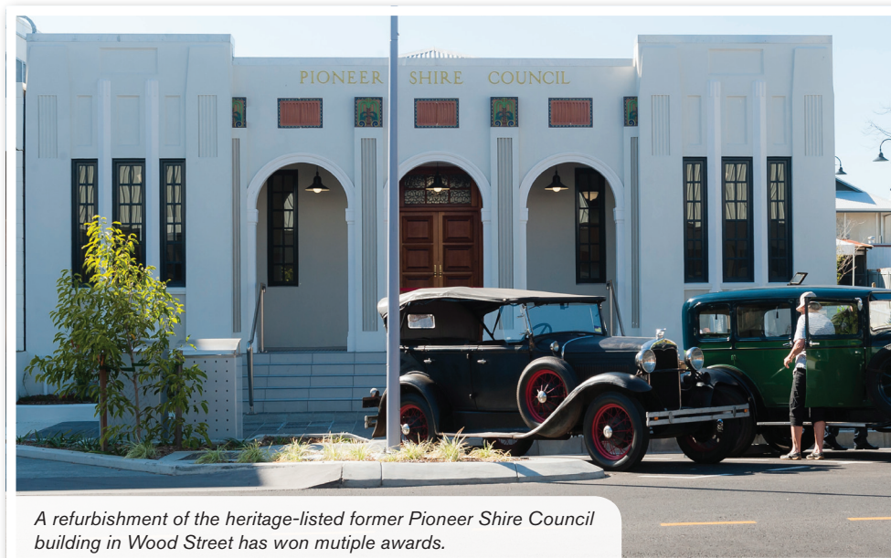
A refurbishment of the heritage-listed former Pioneer Shire Council building in Wood Street has won multiple awards.

Supported by council and the City Centre Taskforce