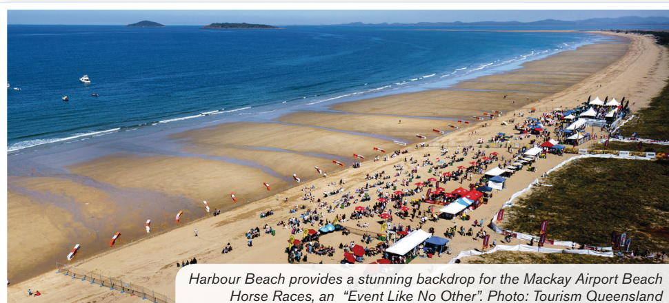
Harbour Beach provides a stunning backdrop for the Mackay Airport Beach Horse Races, an "Event Like No Other".

The Mackay Bluewater Fling is sponsored by Mackay and District Pipe Band, Dalrymple Bay Coal Terminal, council's Invest Mackay Events Attraction Program and Mackay City Centre.