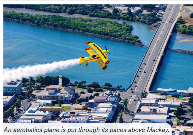
An aerobatics plane is put through its paces above Mackay.

>> Go to the Grasstree Beach Races Facebook page for more details