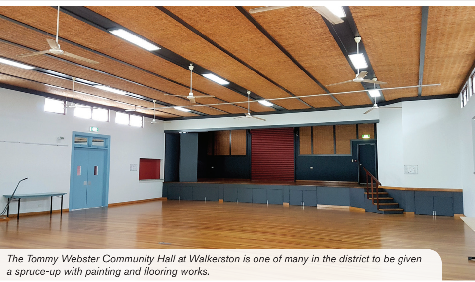
The Tommy Webster Community Hall at Walkerston is one of many in the district to be given a spruce-up with painting and flooring works.

>> The Mansfield Drive, Vic Bridger and North Street park projects, funded by the State Government's W4Q, supported 16 Mackay jobs