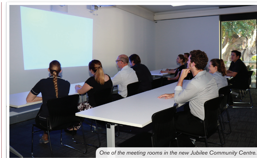
One of the meeting rooms in the new Jubilee Community Centre.

"We also spent about $200,000 on timber bridge upgrades throughout our region. Another $160,000 was spent on boat ramp facilities near the River Street boat ramp."