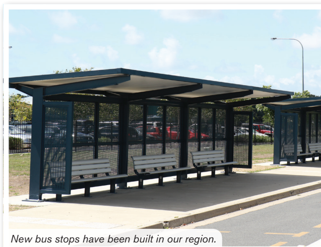
New bus stops have been built in our region.

> $1.6 million: Gravel resheeting of rural roads