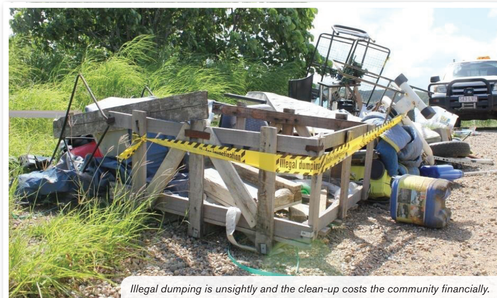
Illegal dumping is unsightly and the clean-up costs the community financially.

BRING your helmet and scooter down to the Sarina Skate Park on Sunday, April 17, and join the scooter competition. An initiative of the Sarina Youth Centre and sponsored by Troppo's Skate N Scoot, the event will have loads of prizes, a DJ and will be fully catered. Nomination forms must be completed prior to competing and can be collected from the Youth Centre or Troppo's. The comp kicks off at 10am.