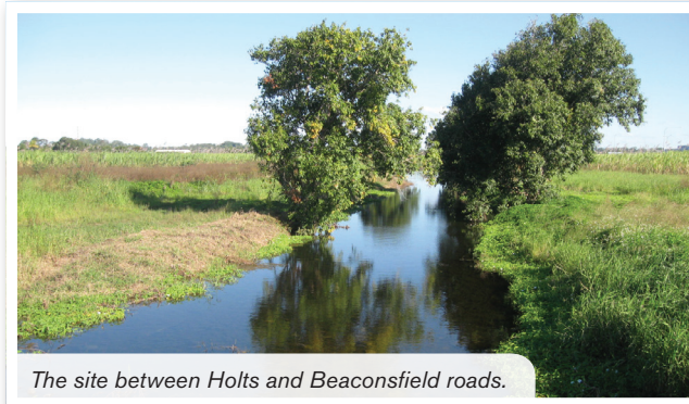
The site between Holts and Beaconsfield roads.

>> For more details visit mackay.qld.gov.au or call 1300 MACKAY (622 529)