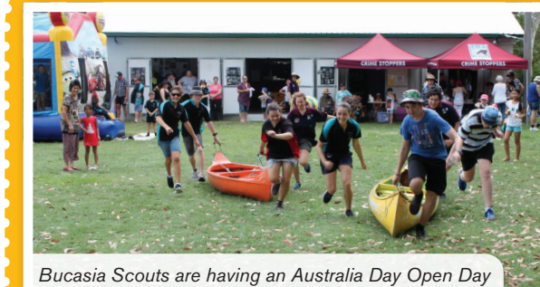
Bucasia Scouts are having an Australia Day Open Day

>> Visit mackay.qld.gov.au/australiaday to nominate someone deserving for an award. Nominations close at 8am on Tuesday, January 10