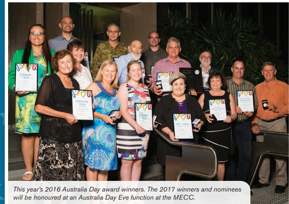
This year's 2016 Australia Day award winners. The 2017 winners and nominees will be honoured at an Australia Day Eve function at the MECC.

>> Visit mackay.qld.gov.au/australiaday to nominate someone deserving for an award. Nominations close at 8am on Tuesday, January 10