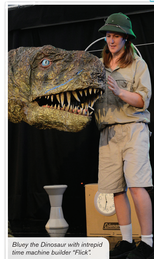
Bluey the Dinosaur with intrepid time machine builder "Flick".

The MECC is encouraging families to get in early and register for the workshops and tours to avoid disappointment on the day. Book now online or at the MECC box office.