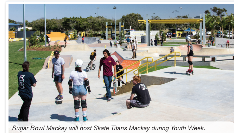
Sugar Bowl Mackay will host Skate Titans Mackay during Youth Week.