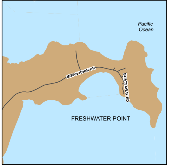
EVACUATION ZONE: BROWN (Up to 3m > HAT)