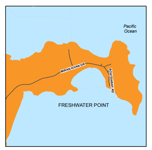
EVACUATION ZONE: ORANGE (Up to 2m > HAT)