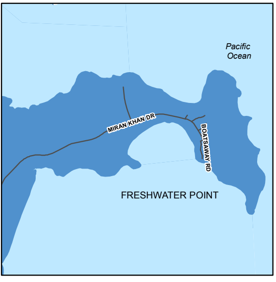
EVACUATION ZONE: BLUE (Up to 6m > HAT)