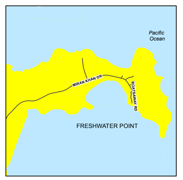
EVACUATION ZONE: YELLOW (Up to 4m > HAT)