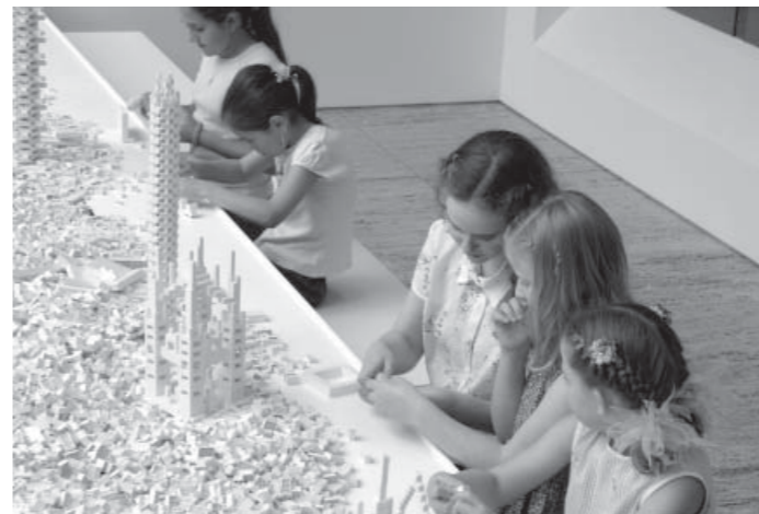
Children participating in Olafur Eliasson's The cubic structural evolution project 2004. White plastic Lego blocks, wood, mirror. Purchased 2005. Queensland Art Gallery Foundation Grant. Collection: Queensland Art Gallery.