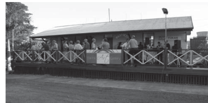
Sarina Art Gallery, Field of Dreams Parkland, Railway Square.

Open Wednesday - Sunday 9am - 3pm. Featuring artwork by local emerging regional artists. 410 Greenhill Road, Ilbilbie Qld 4738. Contact Rhonda Page 4950 1174 / 49503112 (A/H).