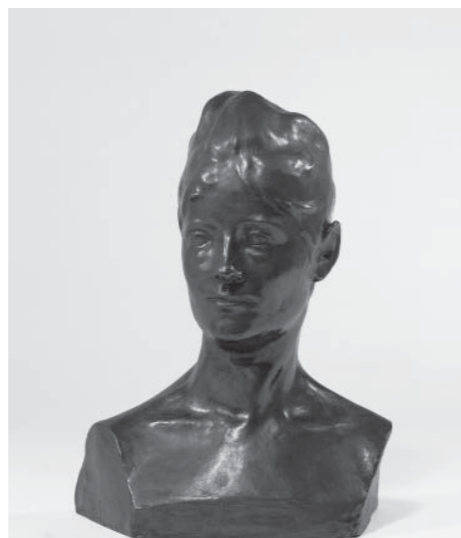
Paul GAUGUIN , France 1848 – 1903. Madame Schuffenecker c.1890, cast c.1960. Bronze, at least 20 casts. 44 x 32.5 x 18cm. Purchased 1982. Queensland Art Gallery Foundation

Myth to Modern: Bronzes from the Queensland Art Gallery Collection / 5 December 2008 – 1 February 2009. Showing in the McAleese Gallery this exhibition draws on the Queensland Art Gallery's collection of figurative bronze sculpture to explore the application of this enduring medium across a variety of subjects and themes. Myth, legend, portraiture and Modernism feature in a selection of works, dating from c.1700 to the emerging Modernism of August Rodin, and early twentieth-century works by Jacob Epstein and Henry Moore. This intimate focus exhibition, comprising 14 works by predominantly European artists, also includes works by Australian sculptors Daphne Mayo, Bertram Mackennal and Harold Parker, who were directly influenced by the rich tradition of Western myth and history. Artspace Mackay, Gordon Street, 4961 9722.