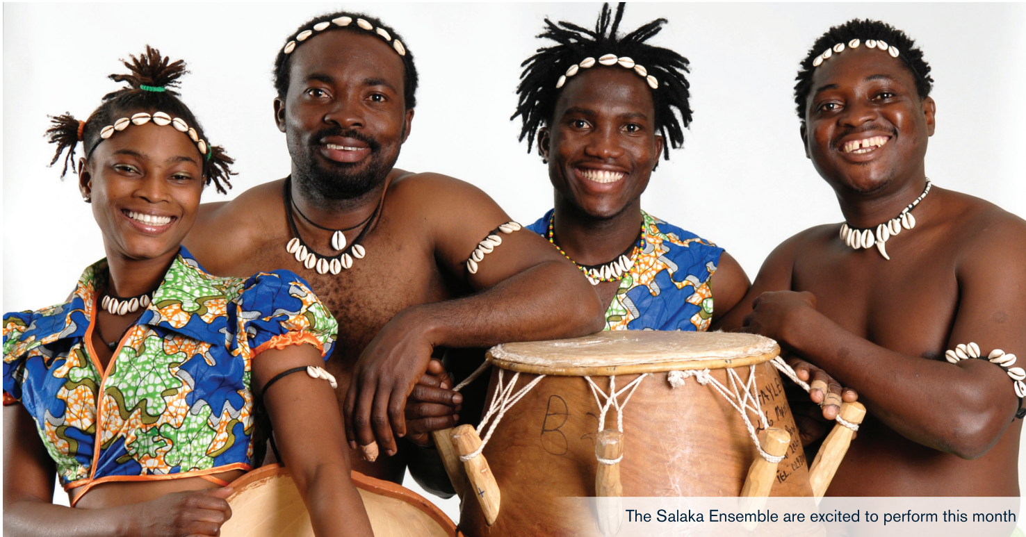
The Salaka Ensemble are excited to perform this month

“They come direct from Ghana and will deliver an uplifting live show that blends vibrant rhythms, amazing vocal harmonies, stunning costumes, exotic percussion grooves and almost superhuman dance moves,” Cr Englert said.