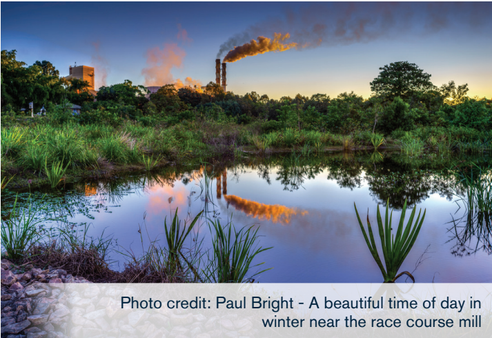
Photo credit: Paul Bright - A beautiful time of day in winter near the race course mill