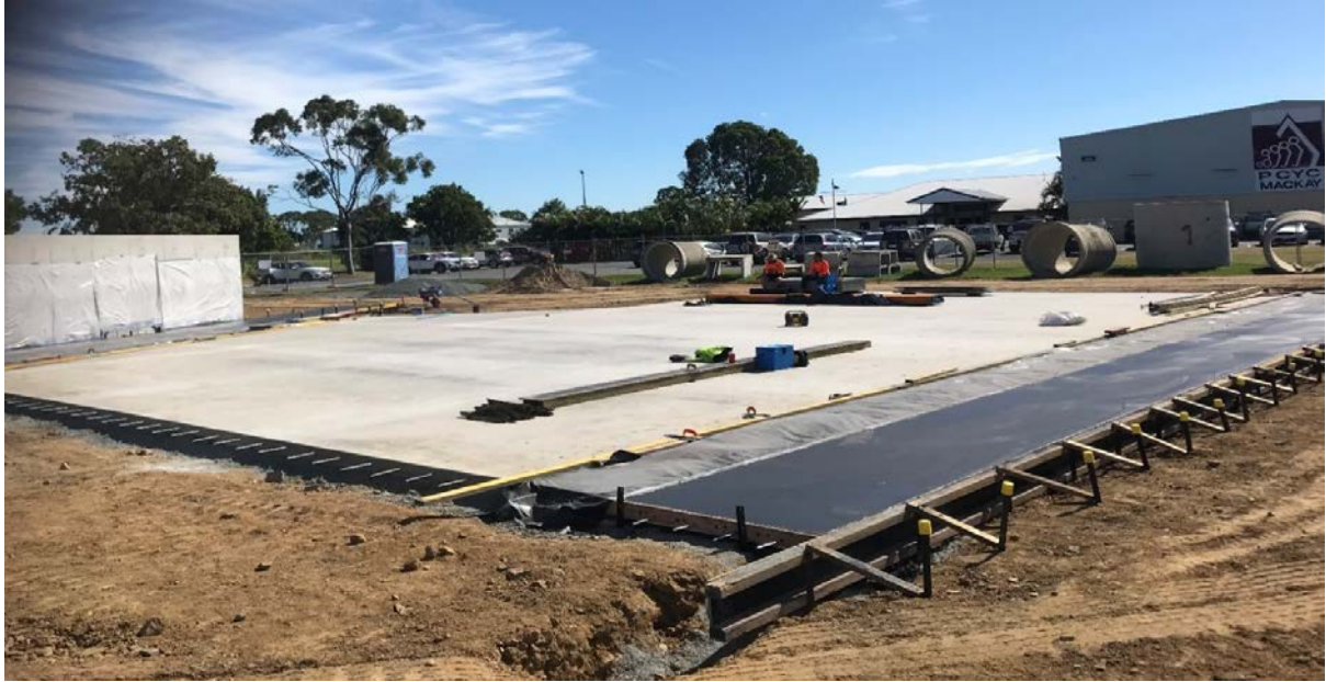
Figure 1 - Multipurpose Court & Hit up Wall under construction