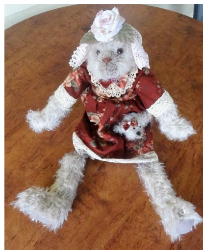
Bear Teacup ($70), Baby Bear Tilly ($45), mohair bear Rosie and Rosebud ($140).