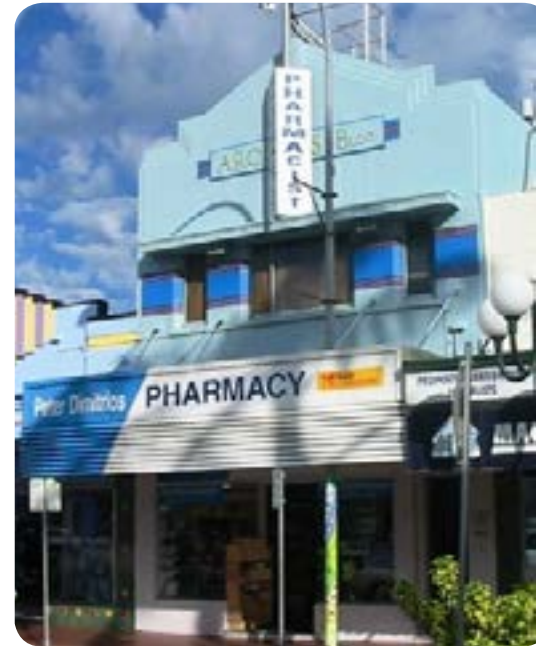
84 Wood Street, 2004, Mackay Regional Council