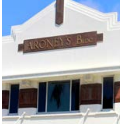
Above: The Art Deco facade, 2016 and Right: Interior of 84 Wood Street, 2015

In recent decades, the building was Dimitrios Pharmacy until it was purchased by the Connors family in 2012. The building has been extensively renovated and won a Heritage Award in 2015 in the refurbishment category. The building is now an entertainment venue and in-keeping with its past is called "The Dispensary".