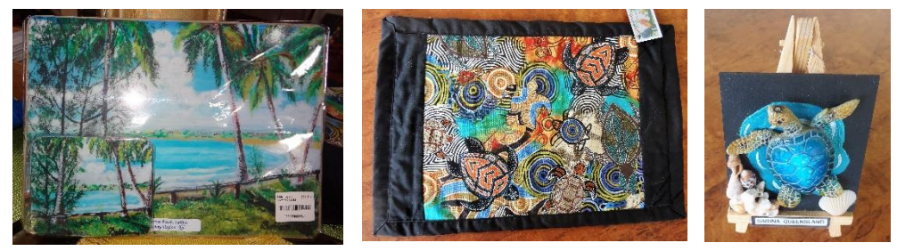
From left: Sarina Beach table mat and coasters ($35) Bev Sonter; Austraiana place mat ($18) Joy

Here are just a few of our Australiana crafts available at the Sarina Arts and Crafts Centre.