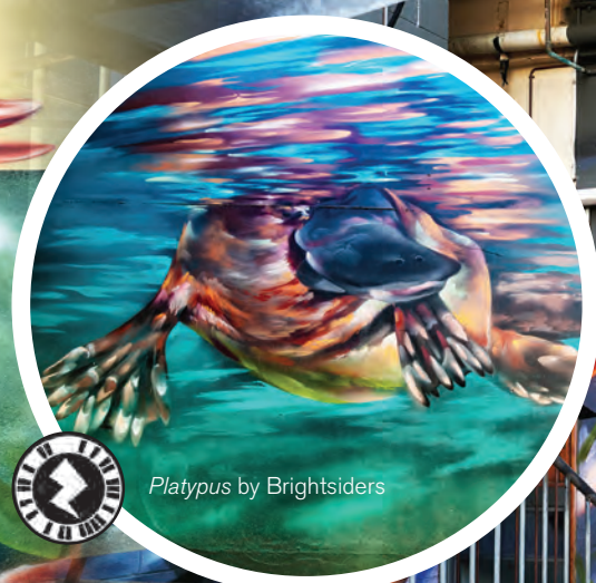
Platypus by Brightsiders