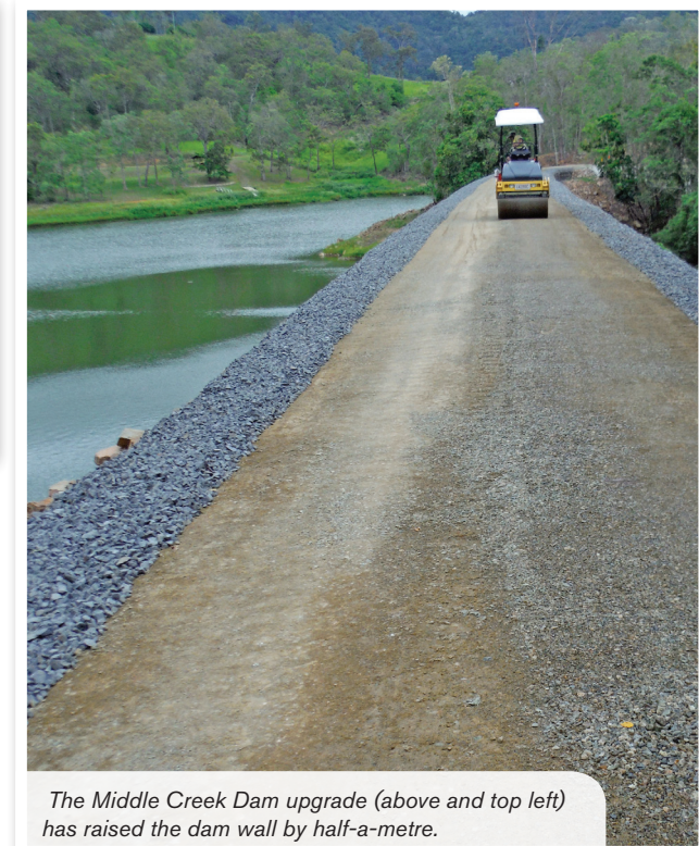
The Middle Creek Dam upgrade (above and top left) has raised the dam wall by half-a-metre.

It will involve the installation of a more efficient spillway to improve capacity. The dam wall will be raised by another 60 to 70 centimetres.