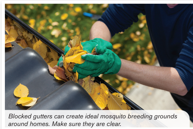
Blocked gutters can create ideal mosquito breeding grounds around homes. Make sure they are clear.

>> Call 4961 9803 or email engagement@mackay.qld.gov.au