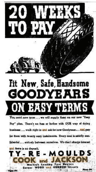
Advertisement 12 August, 1936