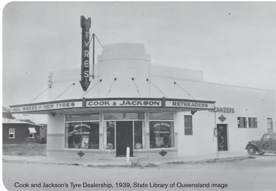
Cook and Jackson's Tyre Dealership, 1939