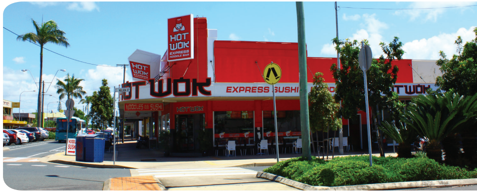
Hot Wok, 2016, Mackay Regional Council image collection

The dealership was a purpose built structure with showroom and retail fronting the corner and intersection and on the Nelson street frontage a drive-in access to the rear work shop.