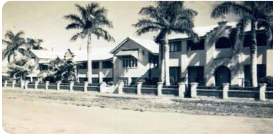
St Patrick's College 1952