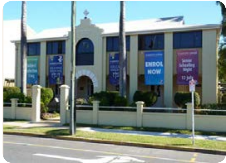
Left: Daily Mercury advertisement, 19 September, 1929; and Above: The remaining part of St Patrick's College, 2015, Mackay Regional Council