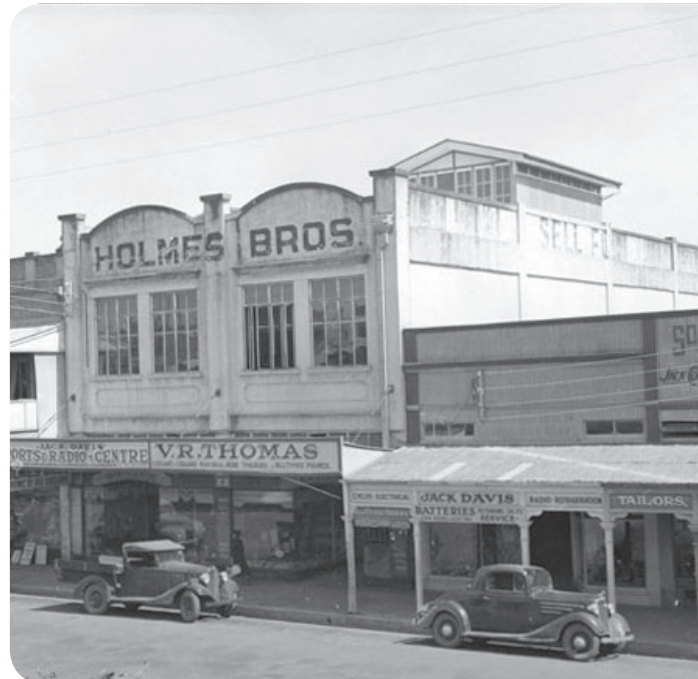
Tilse's Building (left), ca 1940