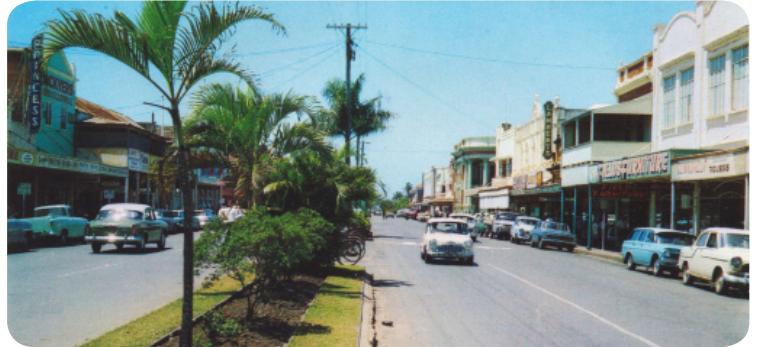
Victoria Street, ca1960