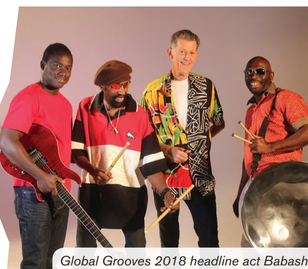
Global Grooves 2018 headline act Babash.