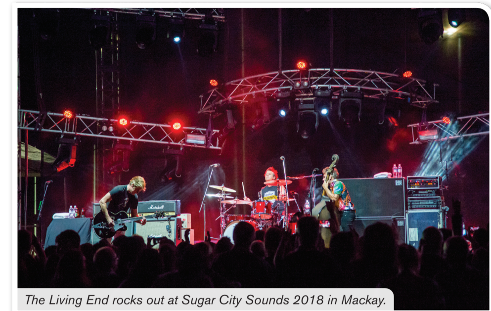
The Living End rocks out at Sugar City Sounds 2018 in Mackay.

This was followed by Proserpine/Airlie Beach with