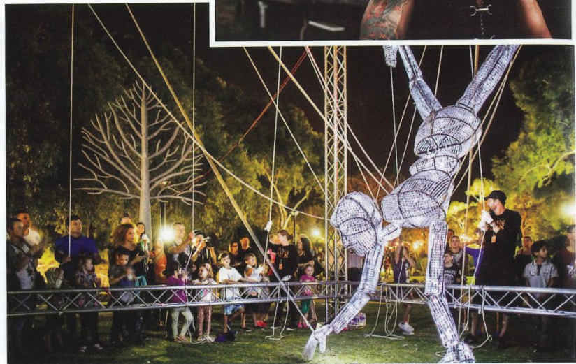
DBCT Illuminate will feature String Symphony, a giant illuminated puppet, hand-woven using more than a kilometre of rope.

No one should be belting out “What about me?” once they get a “Bo Peep” at the official Mackay Festival of Arts program.