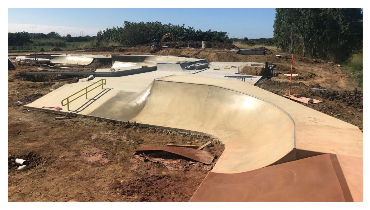
Figure 2 – Street Skate Circuit under construction

For enquiries or for more information, contact Community Engagement on 1300 MACKAY (622 529)