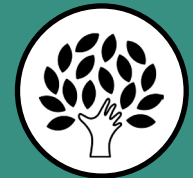
Environmental corridors & connectivity