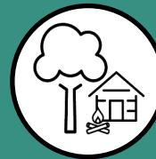
Nature based tourism