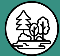
Protection of scenic, landscape & environmental values