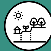
Public amenities & service facilities