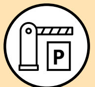
Access and parking