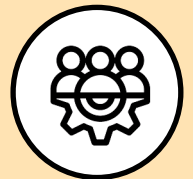
Servicing & infrastructure