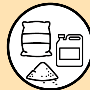
Agricultural supplies store