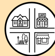
Clustering of non-residential uses