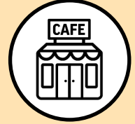
Food and drink outlet